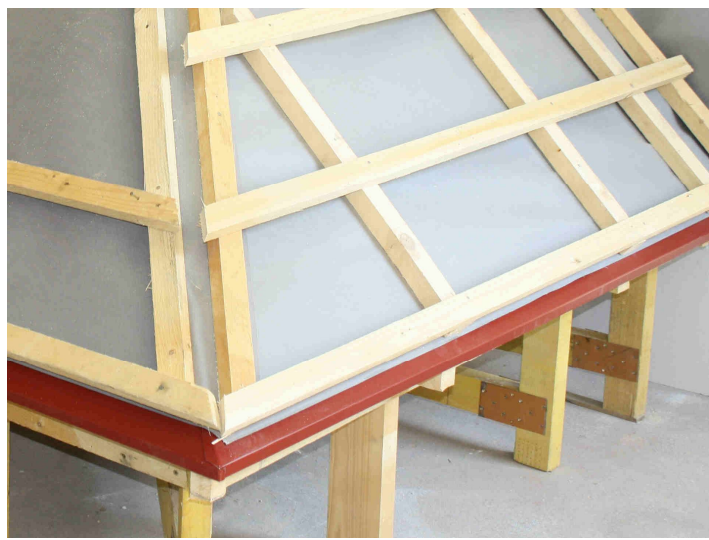
BREATHABLE WATERPROOF MEMBRANE –ROOF EDGE